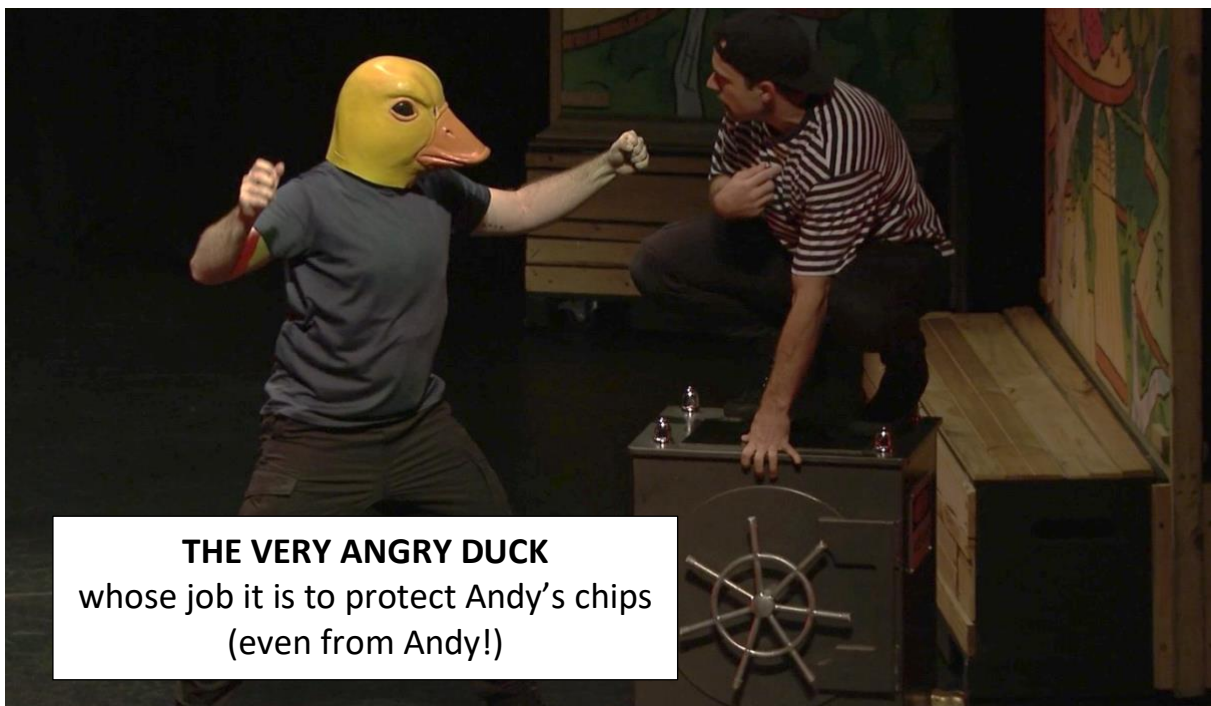
THE VERY ANGRY DUCK whose job it is to protect Andy's chips (even from Andy!)