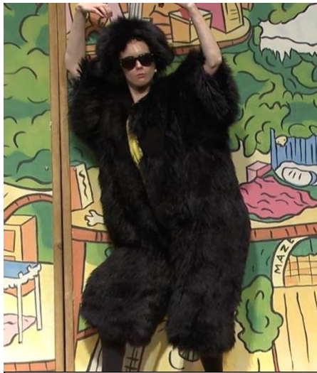
MEL GIBBON A famous actor who is also a gibbon

Some of the other characters we will meet are: